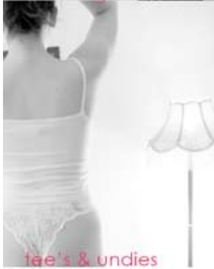
tee's & undies